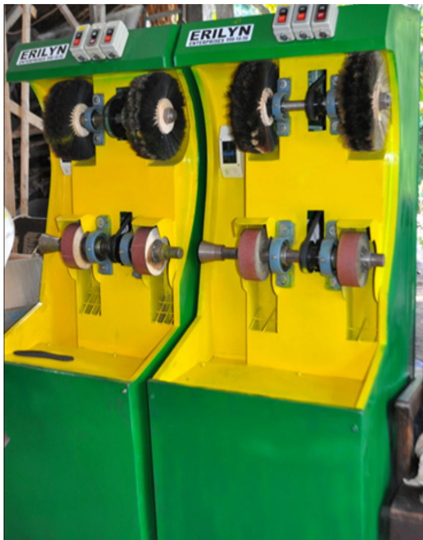
Roughing / scouring machines given to the footwear makers of Camalig, Albay.