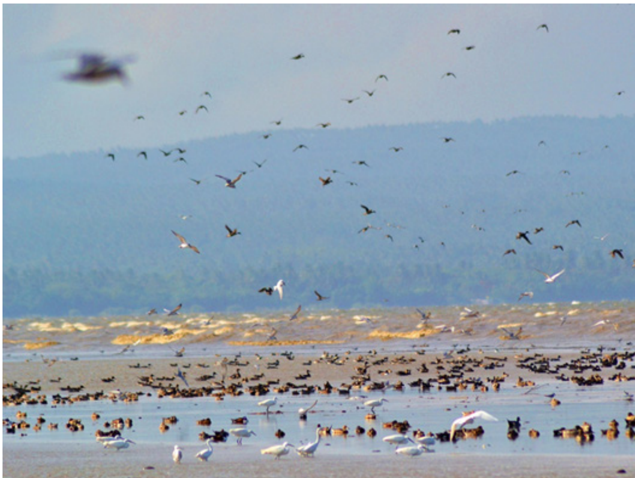
On the Flight. Migratory birds flock together as they settle in the banks of Cabusao wetland in Camarines Sur.