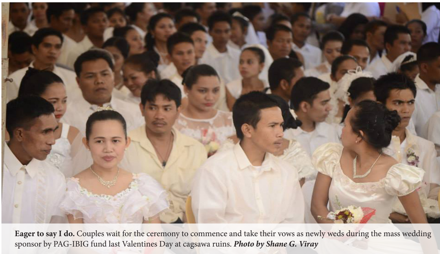
Eager to say I do. Couples wait for the ceremony to commence and take their vows as newly weds during the mass wedding sponsor by PAG-IBIG fund last Valentines Day at cagsawa ruins.